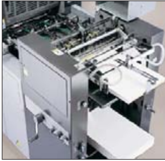
Pre-piling enhances productivity by allowing the operator to preload paper on the lower table while the machine continues to run.