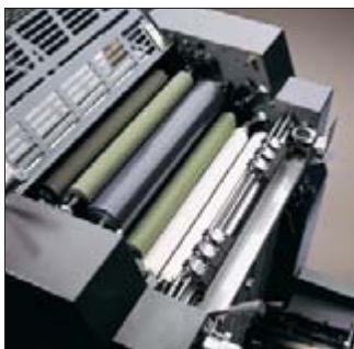
Each printing head has 16 inking rollers including 3 form rollers of differing diameters. The 'stepless' inking and 5-roller molleton dampening system allows maximum control of the printed image.

IKE, which works only on a DPM RIP, also determines the optimal ink fountain roller sweep (duration ink is applied) that controls the overall ink densities.