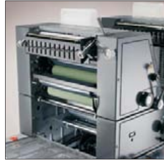
Segmented Lever Actuated Ink Fountains add a great deal of automation for increased productivity and fewer wasted sheets.