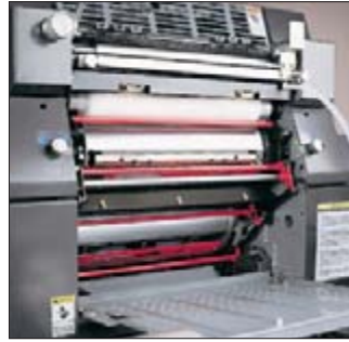
Straight-edge plate clamps with positioning pins are featured. Cylinder safety bars and covers protect fingers.