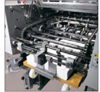
For added convenience, the 9985's chain delivery has an automatically receding paper platform that can be wheeled-away.