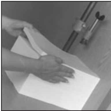
1-Tilt & Load

Turn your padding operation from messy inconvenience to high-capacity profit center with simple 1-2-3 operation