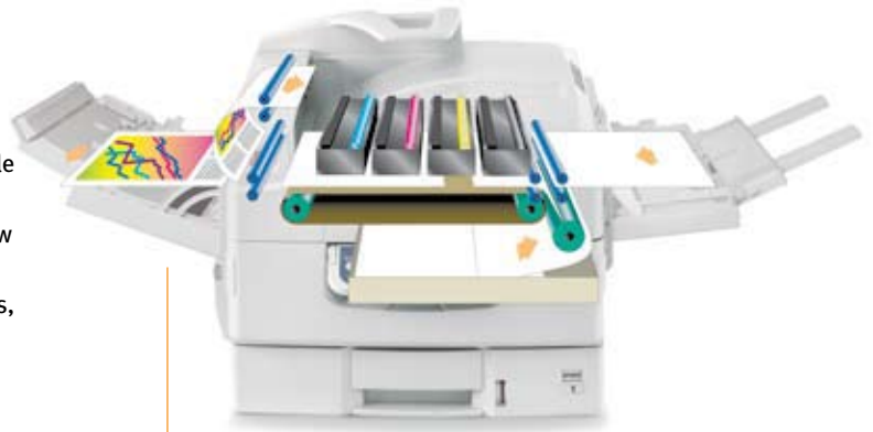
Single Pass Color™ technology and straight-through paper path handles thick paper stock and banner sheets.

The pro900DP from Oki Data Americas, Inc.: high capacity and high quality—the right Digital Press for your demanding, color-sensitive short-run printing needs.