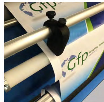
INLINE ROTARY SLITTERS trim the sides of output during lamination to save time and increase productivity.