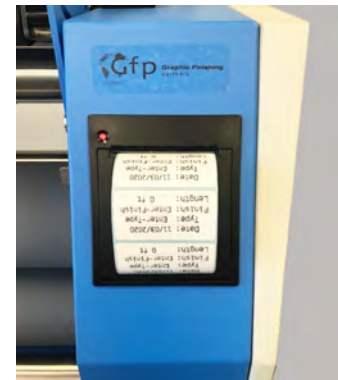
ROLL LABEL PRINTER generates pressure sensitive label with film description and remaining footage for labeling partial film rolls.