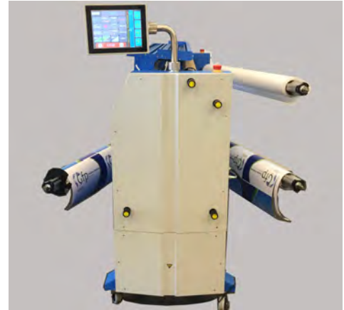
THREE SWINGOUT SHAFTS save time loading and unloading rolls for faster setup and change-overs