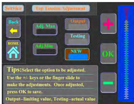
FILM TENSION SENSOR is an adjustable alarm that alerts operator to excess web tension ensuring flat, error free output.