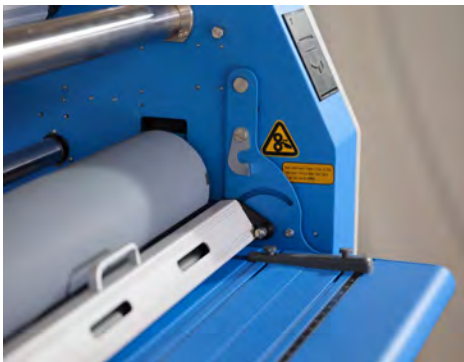
TOP HEAT ASSIST softens film adhesive to reduce silvering for better quality output and to shorten processing time.