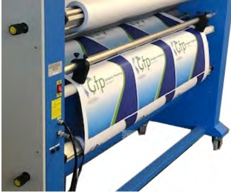
INTEGRATED REAR REWIND is motorized for longer, uninterrupted roll-to-roll operation.

Along with its rugged design and many built-in labor-saving features, the 663TH's electric servo motor and positioning encoder deliver precise control of roller gap position and nip pressure. A host of production class features like integrate rear rewind, inline slitting, and swingout shafts provide the reliable performance the finishing professionals need to ensure the highest quality output and maximum productivity.